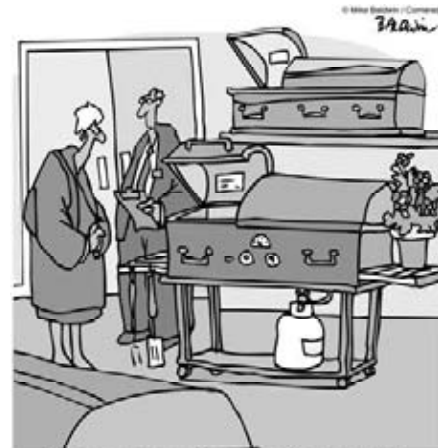
"It's our newest cremation model. Tank sold separately."

We are proud of this 30-year tradition and hope that you are, too.